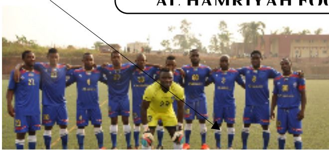
F FRANK FOOTBALL ACADEMY

F FRANK FOOTBALL ACADEMY VS AI. HAMRIYAH FOOTBALL CLUB UAE