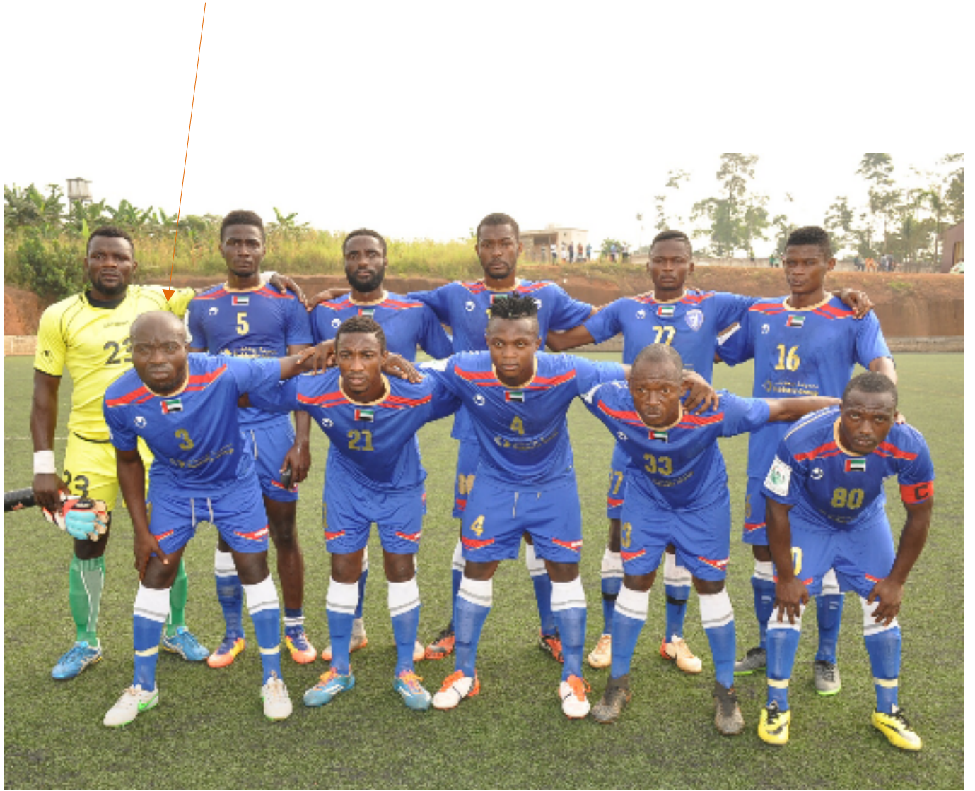
F FRANK FOOTBALL ACADEMY